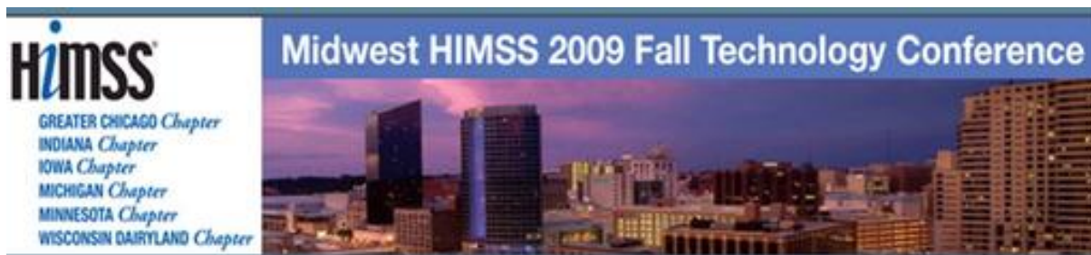
The 2009 Midwest Fall Technology Conference